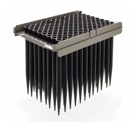
Technical Data Comparison*