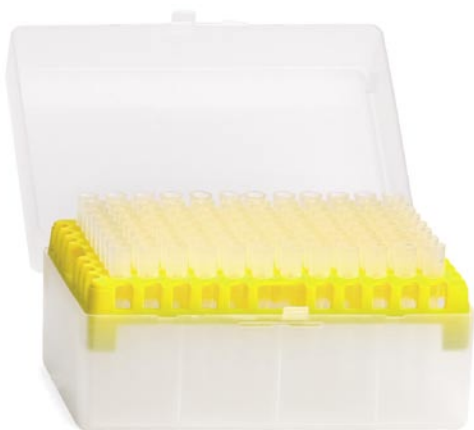
Finntip Filter 200 µl sterile